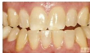
b e f o r e