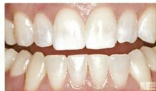
a f t e r

More tooth whitening treatments are successfully carried out worldwide with Opalescence than with any other system