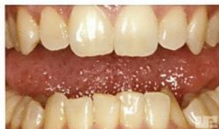
b e f o r e

Tooth whitening is a chemical process. The peroxide in the whitening agent breaks down into tiny molecules that move inside the tooth structure, where they break down any molecules that cause discoloration. Because of this process, the internal colour of the entire tooth is lightened, and the structure of the tooth is not altered at all. Enamel, dentine and any fillings, crowns or veneers are not affected or harmed by the peroxide.