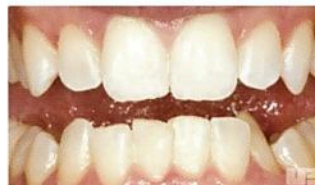
a f t e r