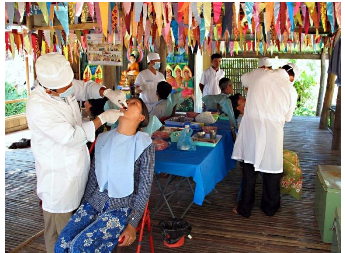
Dentaid volunteers working in Cambodia